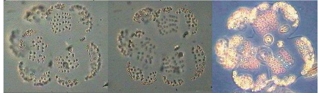
Figure 2. Phaeocystis pouchetii (Hariot) Lagerheim, 1893. motile cell c. 5 μm long, colony up to 1.5-2 mm (Fukuyo, et al., 1990).

Danovaro et al. 2009 stated that the sea snot formation event that occurred in the sea in the Turkish Mediterranean some time ago actually started in the early 1700s which occurred in the Sea of Marmara in September-October 2007 (Aktan, 2008). As recently as December 2020, sea snot formation was scientifically recorded in Turkey's Anakkale Strait above an assemblage of hard, gorgonian, coralligenous, and spongy corals (Özalp 2021). After that, Balkis-Özdelice et al. (2021) found that the bacterium Phaeocystis pouchetii (Pic. 2) produces mucilaginous foam in the Sea of Marmara. This foamy and filamentous formation affects fishing activities carried out by fishermen (Keleÿ et al. 2020).