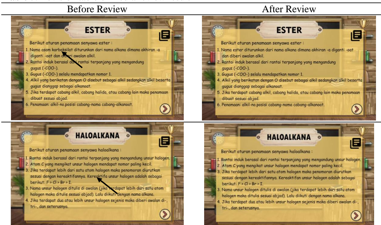
Table 5. Revision table of media review result

The result of the validity test can be seen in Figure 1 below.