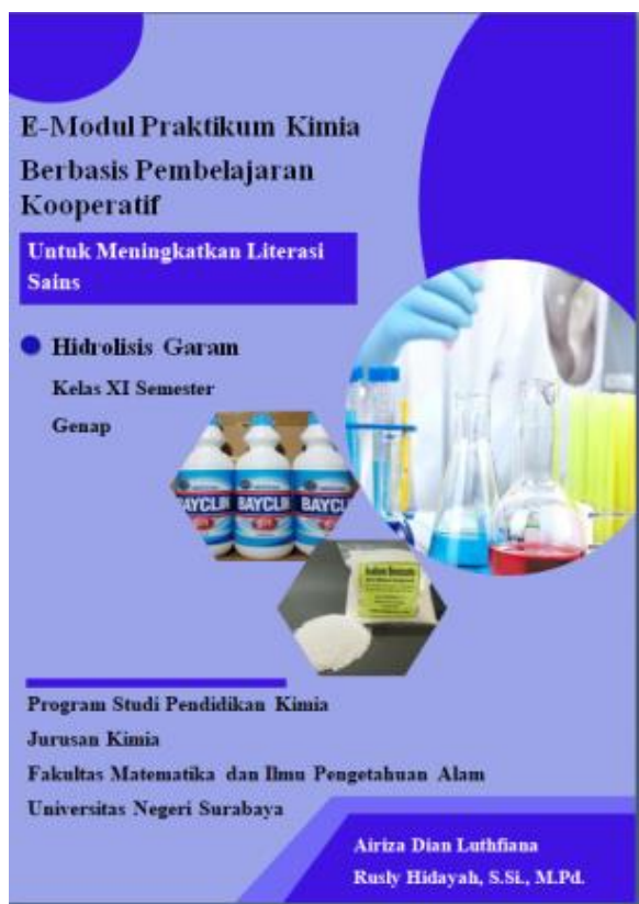
Figure 1. Cover

Then there are 2 learning activities (KB) in this module. KB 1 contains general questions about salt hydrolysis materials. This activity also covers the literacy domain in content knowledge because it contains knowledge about salt hydrolysis.