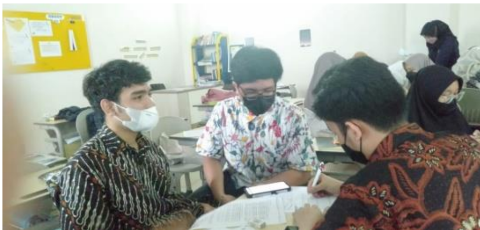
Figure 3. Limited Trial Activity

Innovation or development in learning media is very important because the media is easily adapted to the times. The research results by Harefa, et al (2019) show that students' responses to chemistry e-module practicum are very high. In the presentation aspect, it gets a percentage of 3.96%, the content aspect is 3.72% and the language aspect is 3.68% so that the practicum module gets a very practical category. Students are very interested in digital integrated modules because it suitable with the industry 4.0 era. The research results by Arifani, et al (2021) also show that student responses to the chemistry practicum based on computational chemistry on acid-base materials obtained a percentage of 85% so that it is included in the very practical category. In addition, the research result by Rahmadani, et al (2018), concludes that teaching materials based on the STAD cooperative model with the guided discovery method are practical, because the average of all components in observing the implementation of teaching materials is 1.89 in the fully implemented category and the results of student responses are 100% in the positive category.