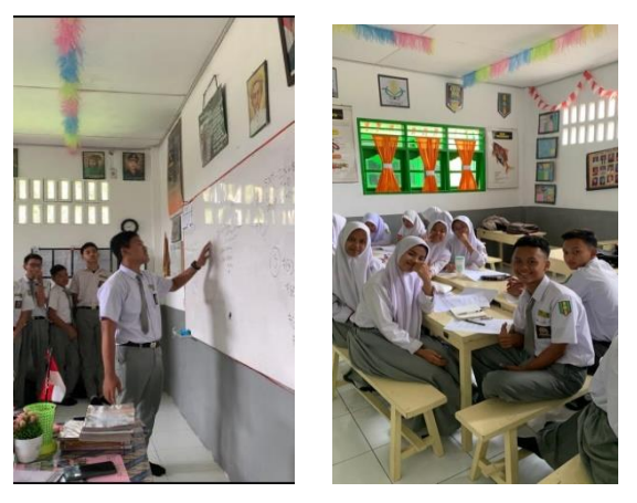
Figure 1. Students' learning activities

Based on research conducted in class XI IPA 1 SMA Muhammadiyah 09 Aek Kanopan obtained quantitative data that measures student interest in learning mathematics. Of the 30 total questions filled out by 30 students, interest in learning mathematics only reached a result of 51.05% resulting in low interest in learning children before using the peer tutor model, This can be seen from the absence of dynamic cooperation of students in providing examples, most students do not focus on listening because of disinterest when contemplating, they note what is on the blackboard without finding out the illustration.