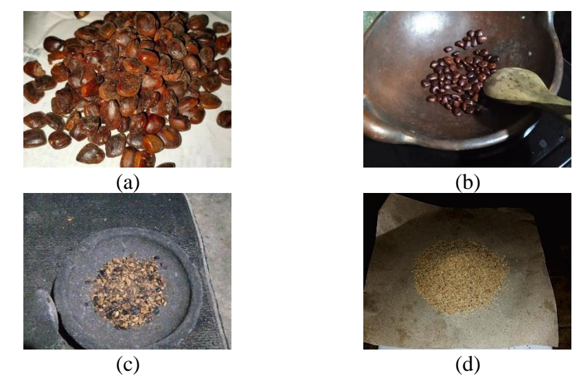
Figure 1. (a) tamarind seeds, (b) roasting tamarind seeds, (c) grinding tamarind seeds, (d) tamarind seed powder after sieving

The tamarind seeds used in this study were obtained from the remaining tamarind used for herbal medicine production in the local area. Furthermore, tamarind seeds are cleaned and then roasted to separate the tamarind seed skin (Hermida et al., 2021). The tamarind seeds are ground into powder and sieved to homogenize and enhance the surface area of the coagulant, facilitating the process of forming flocs when mixed into liquid waste (Poerwanto et al., 2015). The powder is then dried for sixty minutes, approximately at 100°C. It should be noted that exposure to high temperatures exceeding 100°C can result in the loss of active substances in tamarind seeds, thus affecting their efficacy as coagulants (Ferreira Junior et al., 2020). The Tamarind seed powder in Figure 1 is obtained by calculating the initial weight of tamarind seeds, which is 108 grams. After being dried, the weight decreased by 60 grams, so according to the mathematical calculation, the content of tamarind seeds was 44.5%.