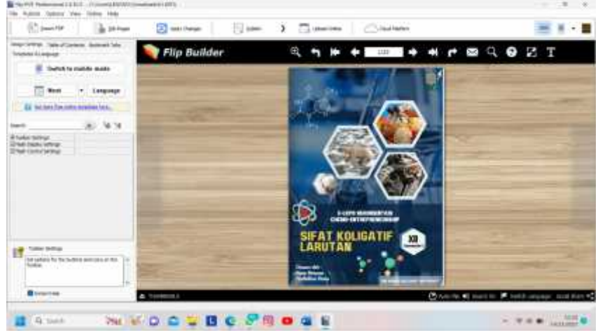
Figure 3. Process of changing the e-worksheet in the form a PDF file into a link

The third stage was Development, which was carried out by developing the e-worksheet product as a link created using the Flip PDF Professional application, as seen in Figure 4. After downloading the e-worksheet, it was uploaded to the Flip PDF Professional application. After successfully uploading to the Flip PDF Professional application, the file that had become a flipbook was published online so that a link appeared. Files were published online using high quality for a more attractive appearance and more explicit images. The link was then copied, and after that, it can be distributed online. The e-worksheet was distributed via a link so that e-worksheet can be easily accessed. After the product was finalized, the next step was a review by one material expert, one media expert, four reviewers (high school chemistry teachers), and students (see Table 2). The review results of these experts were then used as a consideration to determine the product's suitability.