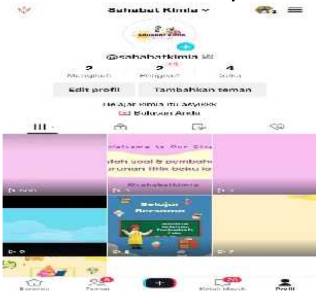
Figure 2. TikTok Video

access the videos presented. Question evaluation is useful for measuring students' understanding of the material presented. The questions for practices were made using Google Forms, where the links to these forms were included in the e-worksheet. After completing the questions, students can submit them and check the scores they obtained.