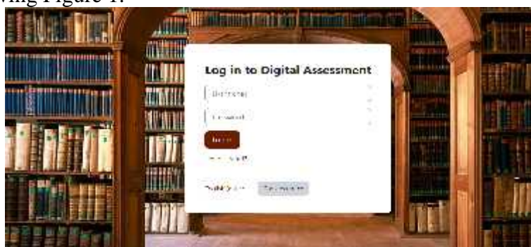
Figure 1. Login Display Moodle

Digital Assessment-based Moodle has gone through the design or design stage where the aim is to prepare a prototype Digital Assessment by using the application Moodle as well as the preparation of scientific literacy questions based on the dimensions of scientific literacy that PISA has determined by utilizing the feature of the variety of question types on Moodle consisting of multiple choice questions, complex multiple choice questions, matching questions, short answer questions and essay questions. The login view from Moodle can be seen in the following Figure 1.