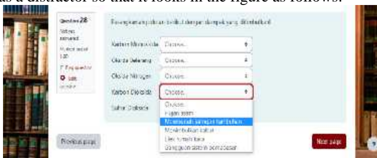
Figure 2. Display of matchmaking questions before revision

PISA assesses science knowledge as relevant to the science education curriculum in participating countries without limiting itself to general aspects of the national curriculum (Sopiansyah & Masruroh, 2021). The formulation of each scientific literacy item has been based on the four main dimensions of scientific literacy determined by PISA: knowledge, context, competency, and attitude. If knowledge, context, and competency can be adequately measured, the attitude dimension will be automatically achieved. The development of PISA-based test instruments can train reasoning abilities to increase so that in solving each problem, students can involve various basic skills, one of which is scientific literacy skills (Helendra & Sari, 2021). During the validation process, several things need improvement, one of which is related to the number of pairs of matchmaking questions that need to add one partner's answer as a distractor so that it looks in the figure as follows: