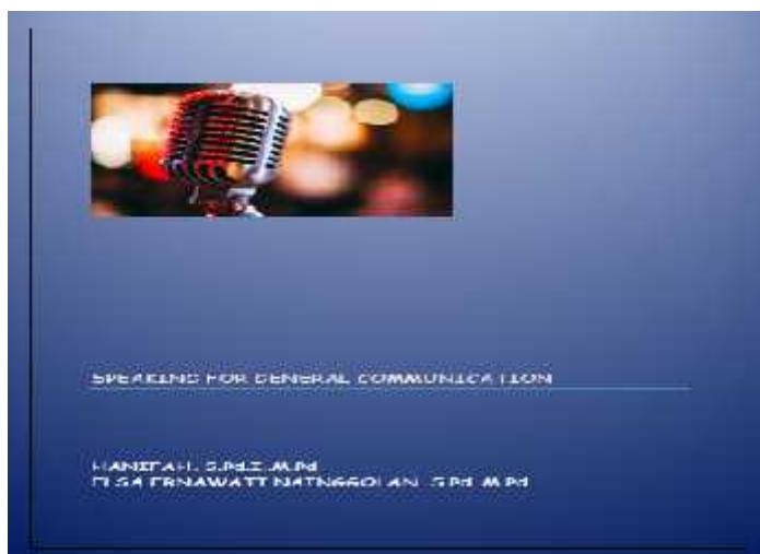
Figure 1. E-Module Cover