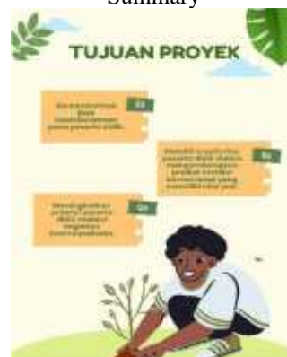
Figure 5 Project Objectives