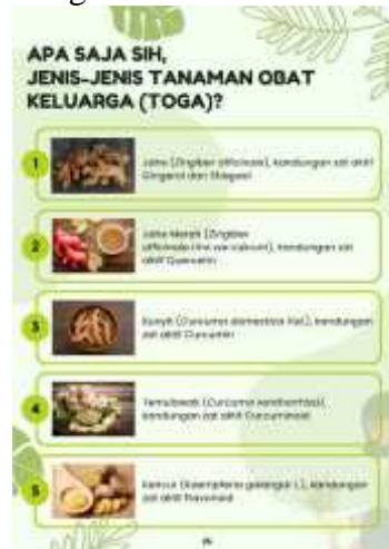
Figure 3 Summary