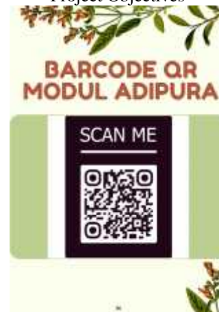
Figure 7 Barcode QR Module P5 Adipura