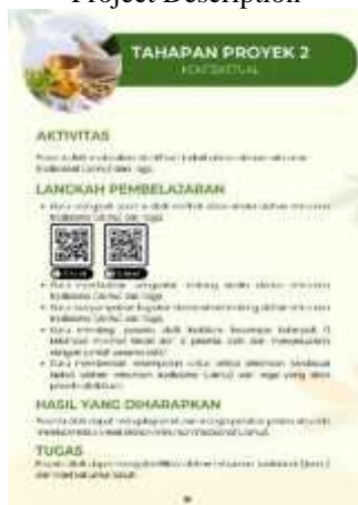
Figure 6 Project Stages