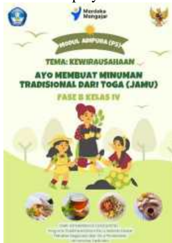
Figure 2 Module Cover

the Poppins font with a font size adjusted to the appearance of the P5 Adipura Module. Project Achievements (CP), learning objective flow (ATP), materials, learning activities, experimental activities, and evaluation questions contained in the P5 Adipura Module are adapted to material on types of family medicinal plants (TOGA), material on the benefits of Family Medicinal Plants (TOGA), and material introducing various herbal preparations from (TOGA). The module display can be seen in the image below.