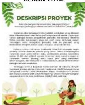
Figure 4 Project Description