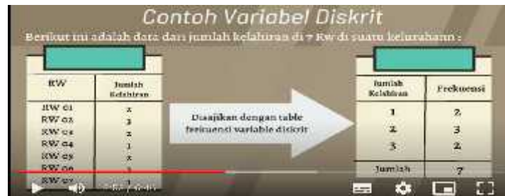
Figure 2. Screenshot of One of the Group Work Videos

The interviews and the Figures showed that the mathematics teachers applied what they had learned in PMM. Similarly, it was reported by Jawahir & Yusuf (2021) that many teachers modified and gained ideas for designing lessons to be implemented in their future classrooms after attending PMM.