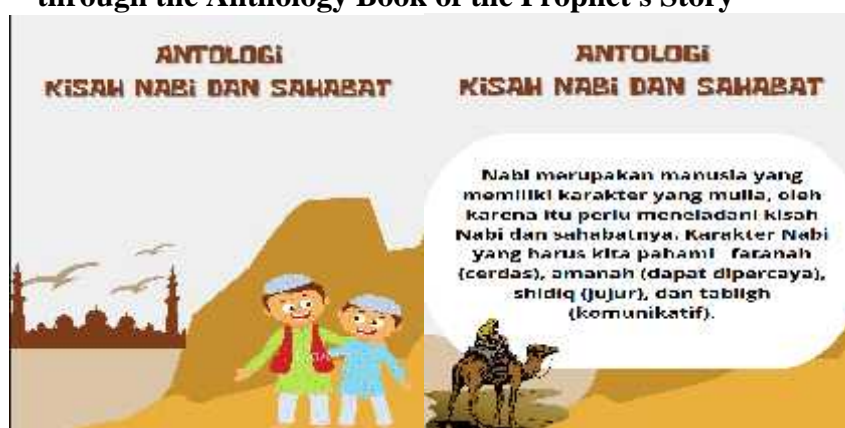
Figure 3. Front and Back Covers of the Prophet's Anthology Book

The stages above refer to the theory of character education regarding character content including knowing the good, feeling the good and doing the good, which is elaborated on with the educational concept developed by previous researchers in the book Targeting Great Character (Siregar & Sari, 2017). It starts with exemplary, why, habituation and system. At the exemplary stage the teacher tells the exemplary of the prophets and friends through books. The teacher becomes a role model of the prophetic character that appears in behavior. The teacher gives an example of writing the story of the prophet by showing the work in the form of a book he wrote. At the why stage, the teacher conveys the nature of the prophetic character. The teacher motivates students to try to have a prophetic character. The teacher invites students to understand the essence of literacy, especially writing. The next stage is habituation. Teachers and students agree on a routine reading schedule. The teacher asks students to retell what was read and discussed in class. The teacher trains students to write gradually. Students try to implement good values in the material they write. The final stage is building the system.