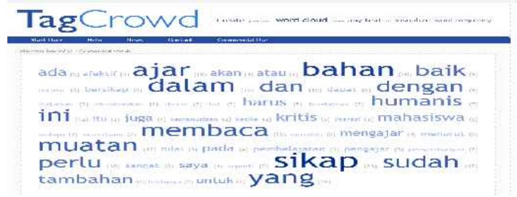
Figure 1. TagCrowd Analysis Results

(Asnawi et al., 2022). As a result, future learning directions can be addressed by teaching materials that are focused on humanistic attitude and behavior activities (Safio et al., 2020) and (Sanjayanti et al., 2018). This is in line with the results of data analysis that has been carried out through the TagCrowd and AntConc technique as follows.