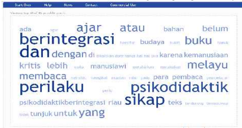
Figure 4. TagCrow Analysis Results

material guides the reader or student to provide awareness in reading. Awareness in understanding human phenomena through experience reflection activities to create attitudes that reflect respect, empathy, care, and tolerance for fellow human beings. Thus, readers can make wise decisions in a humanistic manner according to the principles of Malay life.