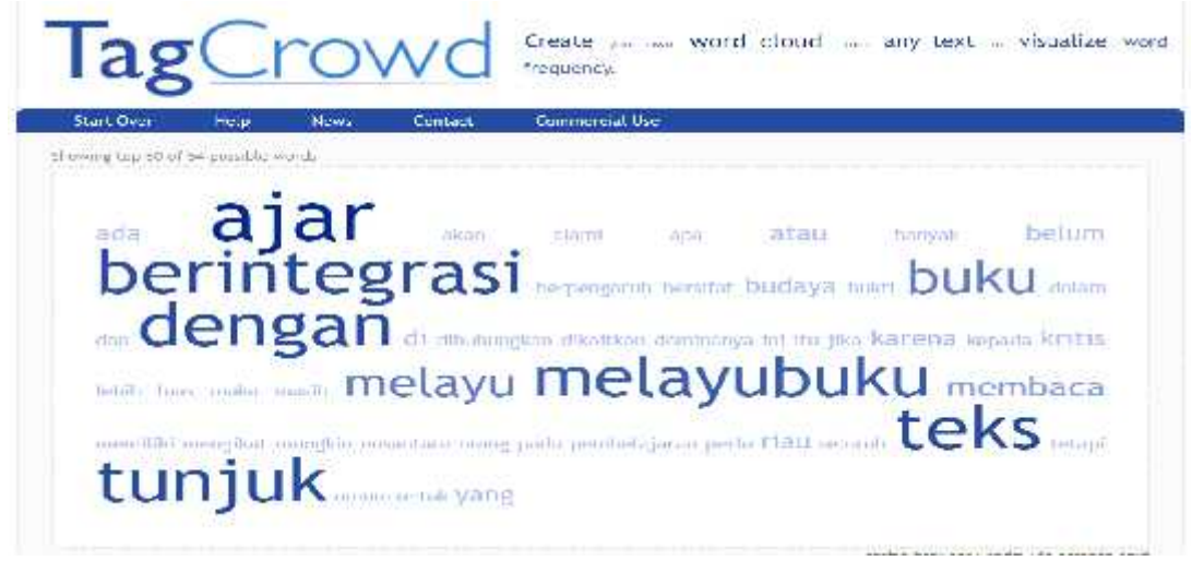
Figure 3. TagCrowd Analysis Results

Based on the analysis of the needs of lecturers and students about the text used in critical reading teaching materials is the Malay Teaching Text. The integration of the Tunjuk Ajar Melayu text in teaching materials for critical reading of the Tunjuk Ajar Melayu text linking humanist literacy can be seen in each chapter. Especially in the fourth chapter, which explains in detail how the text of Tunjuk Ajar Melayu is used to help readers make a critical study of the strands of humanist literacy. The use of Tunjuk Ajar Melayu text aims to make it easier for readers to understand and collaborate on the humanist attitudes and behavior of the Malay community (Asnawi et al., 2021). The use of local culture in learning is important to authenticate learning materials according to the characteristics of the users (Mukhlis et al., 2020) and (Zulaeha, 2013). This is in line with the results of data analysis that has been carried out through the tagCrow and AntConc technique as follows.