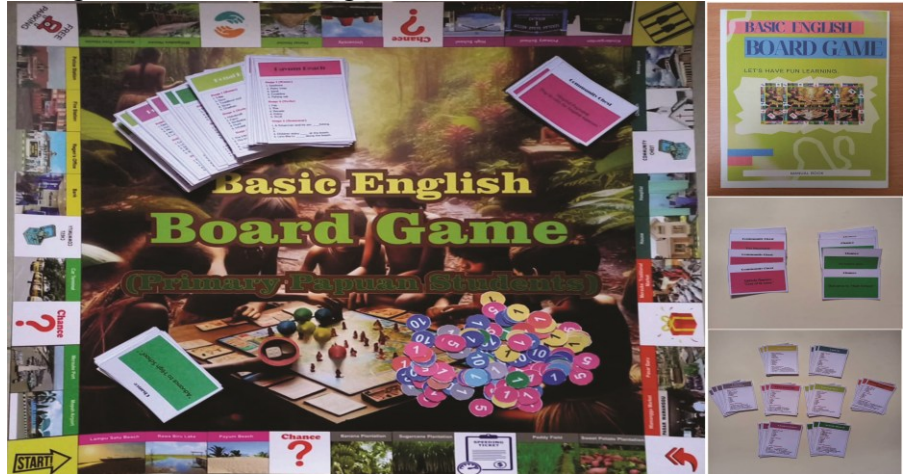
Figure 1. Display of the Basic English Board Game Learning Media

The result of the development of the Basic English Board Game, which has been revised based on the evaluation results from validators and users, incorporates feedback from the validators and users are displayed. These revisions include the selection of locations on the Board Game that focus on the students' indigenous environment, the use of coins with values marked by different colors (1, 5, and 10), and the addition of a manual book to complement the game, as shown in Figure 1.