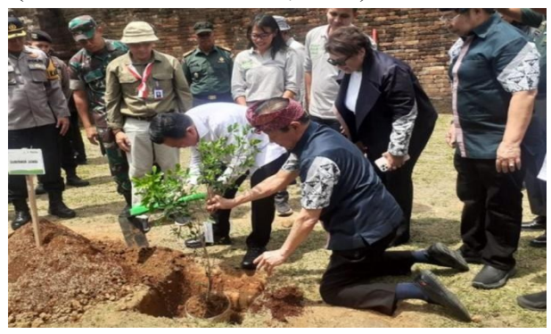
Figure 2. Greening of KCBN Candi Muaro Jambi in Muaro Jambi Regency through the Environmentally Aware (Darling) action of the Djarum Foundation (BLDF) Environmental Service

government recognizes that poor air quality, caused by forest fires and air pollution, must be addressed. As a precaution, residents of Jambi are advised to wear masks when outdoors to protect their health. This initiative has also led to efforts in environmental greening in locations such as the Muaro Jambi temple site. The greening activity was carried out by 200 students from several universities in Jambi Province, who joined the "Ready Aware Environment" movement (Ready Darling), organized by the Djarum Foundation's Environment Devotion Program (BLDF). A total of 11,920 trees and shrubs were planted as part of the greening project at the Muaro Jambi Cultural Reserve (KCBN) in Muaro Jambi Regency, Jambi Province (Maharani & Alexander, 2023).