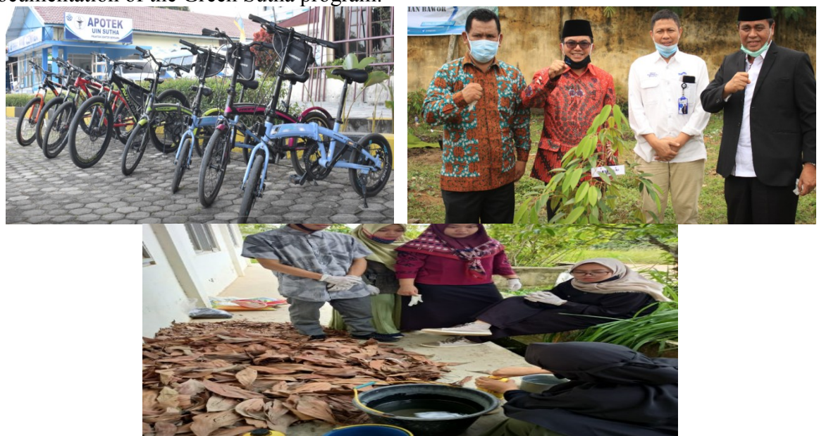
Figure 3. Documentation of efforts to maintain greenery in the State Islamic University environment Sultan Thaha Saifuddin Jambi (Green Sutha, 2023)

implementing greening in the campus environment. This is based on the fact that awareness of caring for the environment and the universe must be implemented. The following is the documentation of the Green Sutha program: