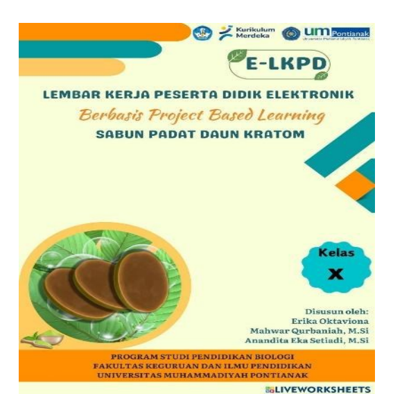
Figure 1.Cover the Liveworksheet-based interactive LKPD