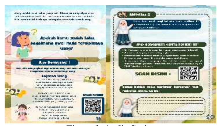
Figure 2. Audio Series

Learners who have kinesthetic learning style tendencies are given learning activities in the form of roleplay, observing the surrounding environment, interviews, and games. The kinesthetic series is developed with activities that make learners move a lot in order to facilitate the needs of learners with kinesthetic learning styles. The learning activities in the kinesthetic series can be seen in Figure 3.