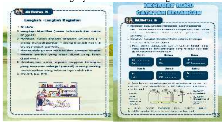
Figure 6. Learner Activity

Not all activities in each series are different; some have the same learning experience. For example, Activity 8, namely, Market Day and Activity 9, making a financial notebook, are intended for students with kinesthetic learning styles. However, students with visual and auditory learning styles are also given the same activities because these activities are essential. Thus, several learning objectives are tailored to each learning style, meaning that the learning experience is different. However, there are learning objectives that are given with the same learning experience, one of which is in activities 8 and 9 described above, because the best learning experience for these activities is that learners must demonstrate directly, so that not only learners with kinesthetic learning styles get the learning experience, but all learners with various learning styles follow the learning.