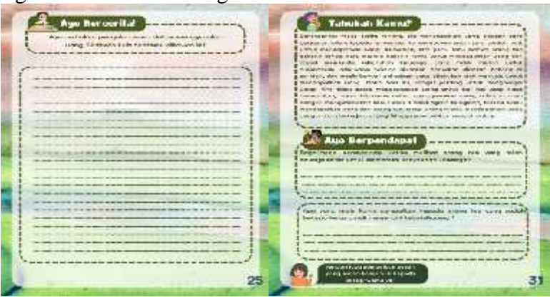
Figure 5. Learner Activity

function of money, at the end, students are asked to tell their experiences when using money. This is so that learning can be more meaningful. These activities can be seen in Figure 5.