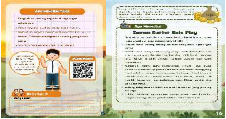
Figure 3. Kinesthetic Series

Learners who have kinesthetic learning style tendencies are given learning activities in the form of roleplay, observing the surrounding environment, interviews, and games. The kinesthetic series is developed with activities that make learners move a lot in order to facilitate the needs of learners with kinesthetic learning styles. The learning activities in the kinesthetic series can be seen in Figure 3.