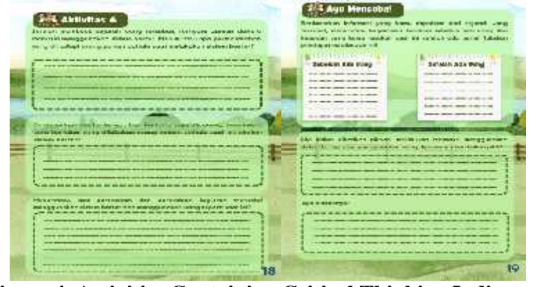
Figure 4. Activities Containing Critical Thinking Indicators

Besides being developed in a differentiated manner, this teaching material can also help students improve their critical thinking skills. Researchers compiled activities on each learning objective that contained critical thinking indicators. The following are excerpts of activities in teaching materials that can help students improve critical thinking skills.