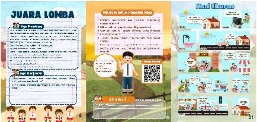
Figure 1. Visual Series

Based on the results of non-cognitive diagnostic tests regarding learning styles, students are divided into three learning styles. So, researchers created a design of teaching materials in three series: visual, audio, and kinesthetic. Then, at this stage, researchers create a learning experience design to facilitate the three learning styles of students. Thus, in the development process, researchers made three teaching materials: visual, audio, and kinesthetic. The visual series presents the material in short stories, comics, animated videos, and pictures. The results of developing a visual series of differentiated teaching materials can be seen in Figure 1.