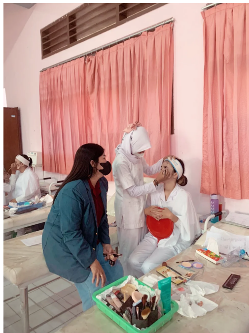
Figure 9. Activities Creating Bushy Eyebrows With Fairly Neat And Precise Results

Therefore, the use of video tutorial media for learning can continue to be employed in future lessons with different topics, as it facilitates students in comprehending the presented material