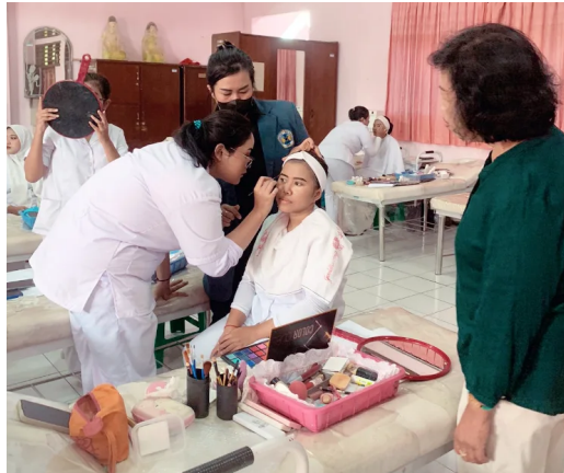
Figure 4. Researcher Activities Directing Students

In the following sessions, the researchers observed that some students had started to work independently, creating bushy eyebrows with fairly neat and precise results, although they still referred to the shared video tutorial link.