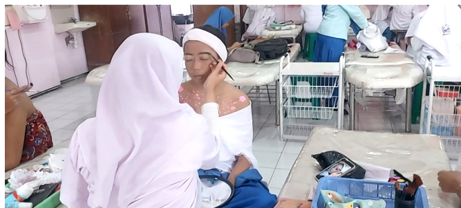
Figure 5. Activities Creating Bushy Eyebrows

In the following sessions, the researchers observed that some students had started to work independently, creating bushy eyebrows with fairly neat and precise results, although they still referred to the shared video tutorial link.