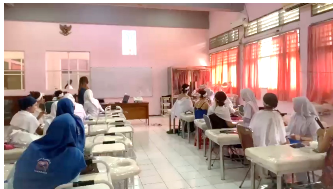
Figure 3. Activities Using Video Tutorial Media In Class

At the beginning of the session, the students were confused as bushy eyebrow is a new technique for them to practice directly on models. It was understandable that all the students had questions and had not yet achieved neat and precise results.