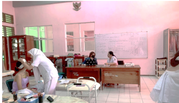
Figure 2. The Researchers Conducted Several Interviews

The researchers conducted several interviews, observations, and documentation to gather data for the classroom research report. Additionally, the researchers made five classroom observations as part of the research, starting from January 18 th to February 15 th .