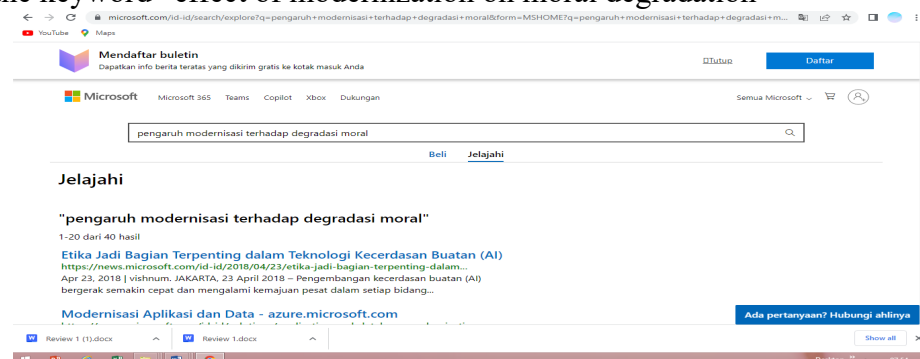
Figure. 2 Enter the keyword

This stage is done to decide whether the data found is feasible or not to be used in SLR research. In this case, the researcher must detail in choosing the appropriate literature. Literature used is related to modernization and moral degradation in the independent curriculum. If you have chosen a quality article, it can be used as a reference to be used as appropriate research.