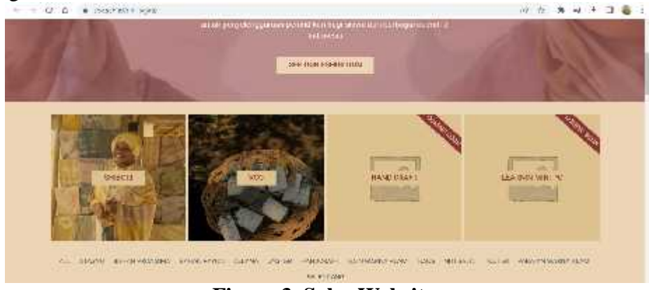
Figure 3. Sales Website

The selling price of Virgin Coconut Oil (VCO) with selected ingredients using communitysourced ingredients, namely coconut, which is the result of processing community gardens around the school, has a selling value of around IDR 15.000 - 25.000 per bottle. Furthermore, as a creative innovation, VCO is packaged in attractive packaging. In other words, prices that adjust are pocket-friendly are the main attraction for buyers. In addition, sales are made through technology and social media. Through the multimedia department, SMK Bakti Karya is considered successful in baiting student motivation and creativity in sales. Together with the entrepreneurship program under the Niti Sajati program, students create a sales link affiliated with the school's website, namely at https://www.sbk.sch.id/niti-sajati/. The following figure 3 describes a website that contains sales content.