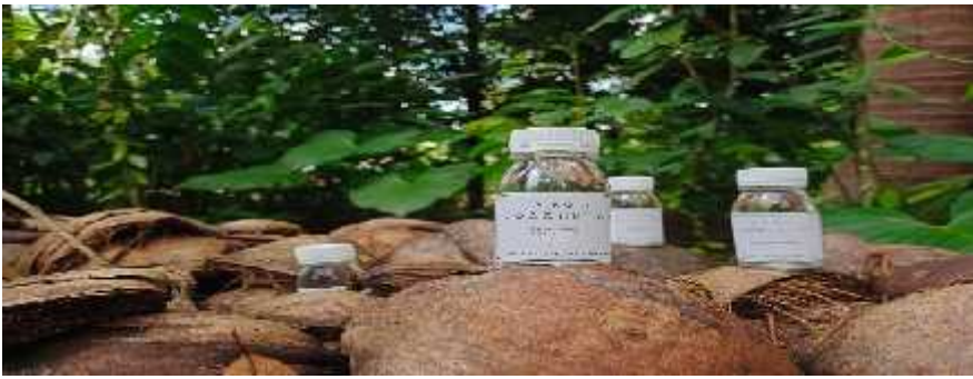
Figure 2. Bottled Virgin Coconut Oil Products

In sales activities, Virgin Coconut Oil (VCO) is packaged in bottles. As in the following figure 2: