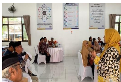
Figure 5. Discussion and Q&A Session

In general, the training activities of transformational leadership training as an effort to strengthen the professional learning community for principals of vocational schools in Ponorogo district run smoothly. Based on the results of the implementation of the training activities, it was concluded that the principals of vocational school in Ponorogo welcomed