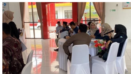
Figure 3. Paperwork guiding activity