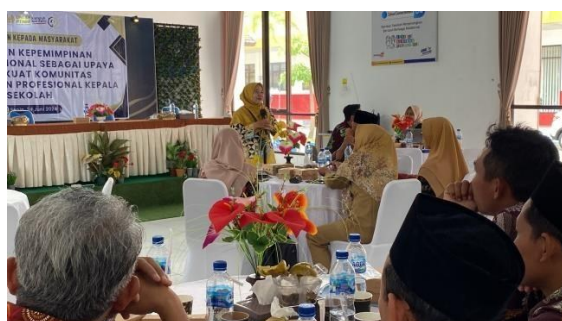
Figure 4. Transformational leadership material presentation