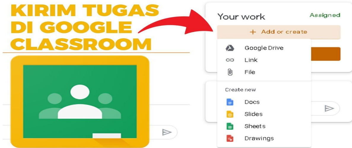
Figure 1. how to submit assignments in Google Classroom

Each student must send an assignment, whether it is a quiz assignment, multiple-choice, or a question that has been given through Google Classroom. Through the image instructions above, teachers can follow the steps in submitting an assignment. Besides having a forum room for discussion, Google Classroom also provides a comment column that can be used to ask questions or provide comments in private.