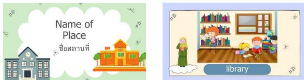
Picture 3. Names of Places and Things at School

In this activity, students were asked to practice conversation, they did not just ask and answer questions, for example, "Where are you going?" and answer, "I am going to the classroom", but also describe them. For instance, "I am going to the classroom. The classroom is orange. The door is grey. The windows are yellow. I love my classroom." For this activity, they had more members. They used printed pictures from Canva and showed them in front of the class. For one sentence they divided it into each member, and the teacher ensured that students understood the concept of using the question and how to describe something. The teacher allowed each member to choose the names of places and things they wanted to present, the students could decide with the group members and using Canva to show pictures.