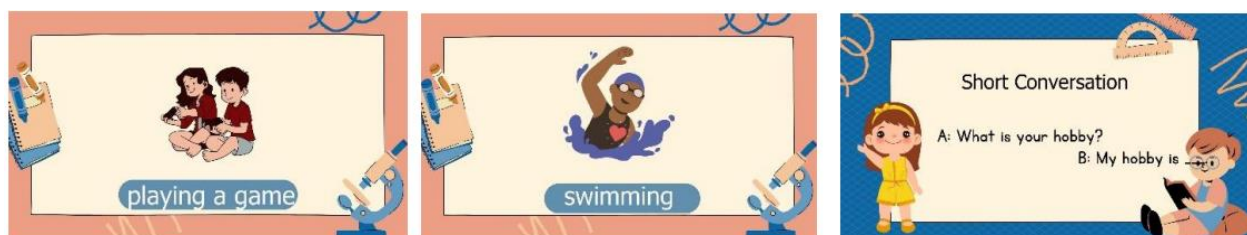
Picture 2. Vocabulary about Hobby

After receiving material about Action Verbs, the teacher used vocabulary that was still related to the previous material and added some new vocabulary, namely hobbies. However, in this practice, students were asked to practice using movement as well. They also played miming games to guess what activities they liked. They showed the pictures from Canva from the monitor, and they practised short conversations with statements: My hobby is.../ My hobbies are . For students to practice in front of the class, the teacher used spin the wheel to make students feel encouraged to present with their friends. This learning looked fun for students since they enjoyed it very well.