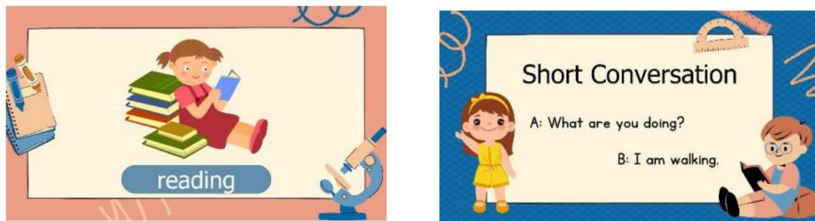
Picture 1. Vocabulary about Action Verb