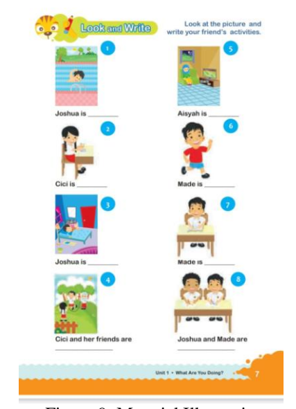
Figure 9. Material Illustration

(b) The criteria for illustrating the material in English textbooks are in accordance with the level of age development of students and are able to help in clarifying the content. Illustrations of the material are presented according to the level of age development of students. This can be seen in various texts that are always accompanied by various color images that help students in clarifying the material. For example on pages 6-7. On page 7, there is a Look and Write activity, in this activity, students must write down the type of activity being carried out by the student by looking at supporting pictures. Illustrations filled with various colors and shapes are expected to be able to attract students' interest in learning. Then, illustration images and text will greatly help students in understanding the purpose of the material being taught. Zeegen (2009), explains that the presence of illustrations will help in sensing the world, recording, describing, and communicating everything that happens.