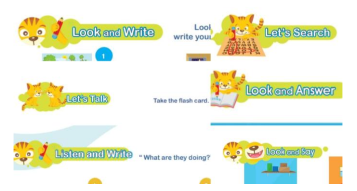
Figure 11. Instructions in a Worksheet

(a) The material is presented interestingly. The material in the textbook is presented in an interesting, straightforward, easy-to-understand, and interactive manner. The delivery of the material is done well and clearly. Then, each instruction in carrying out the activity is arranged very clearly and in detail. According to Harmer (2007) instructions contained in textbooks chould fulfill two criteria. First, the instructions should be clear and unambiguous. Second, the instructions should be written in a language that the learner can understand.