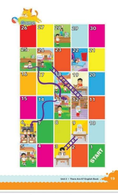
Figure 5. Snakes Game

(d) Being able to motivate to develop itself, this textbook meets this criterion. In this book, the material is presented very interestingly and provides a variety of activities that can motivate students in developing their skills, those are, speaking, writing, listening, and reading skills. Harmer (2007) argues that a textbook must include formula skills and be implemented. In speaking skills, there is a Let's Talk activity on page 30. Let's Talk activity requires students to give their opinion on the circumstances indicated by a flashcard card randomly drawn by their friend while still paying attention to the available instructions. It is hoped that, by seeing other students able to give their examples and opinions, students who are not able to become motivated to be able to give their opinions. Then, in listening and writing skills, this book provides a Listen and Write activity "what are they doing" on page 8. Accompanied by explanatory pictures, this activity is expected to be able to motivate students in writing and hearing the instructions given.