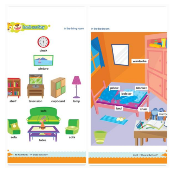
Figure 1. Objects in the Room

The concepts used in this book are clear and unequivocal. The materials available in the book can also help the student in developing the potential that exists in him, increasing creativity, independence, responsibility, etc. Therefore, this book can facilitate students in achieving national educational goals. Meliawati, M. & Hamied, F. A (2020) argue that textbooks can provide input to teachers in the form of materials, exercises, instructions, and texts that can assist students in achieving learning objectives that will be achieved later.