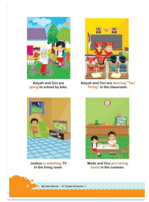
Figure 2. Sample of the Grammar Used

(c) Encourage the emergence of independence and innovation. Suhandi, A. & Kurniasri, D (2019), mentioned that independence in learning is one aspect that determines student success in learning. Therefore, by having independence, students are expected to be able to develop their various abilities in completing the assigned tasks and become qualified and responsible people.