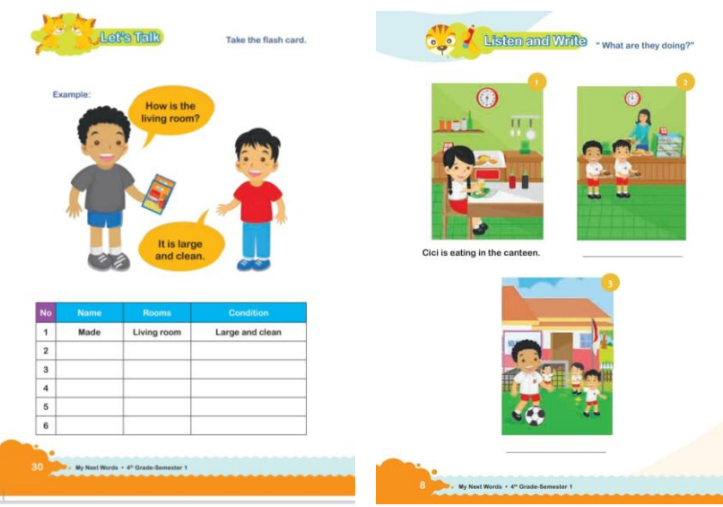
Figure 6. Let's Talk