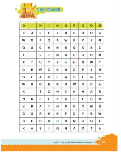
Figure 3. Sample of Let's Search Activities