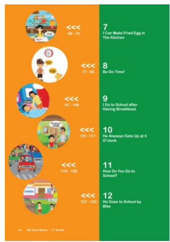
Figure 10. Table of Contents