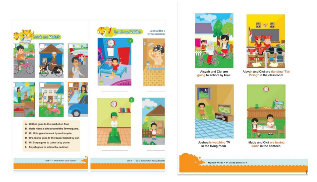
Figure 8. Examples of Cultural Diversity and Respecting Differences

(e) Able to maintain national unity and unity by accommodating diversity, mutual cooperation, and respecting various differences. The textbook My Next Words is able to maintain unity, respect differences, mutual aid and accommodate diversity. There are several activities that can make students work together and appreciate differences. An example is the Let's do Survey activity on pages 92-93. On the page, the student must conduct a survey and ask his friend about the available questions. And in this activity, students must be able to work with their group to conduct surveys and appreciate any differences in answers from their friends. In addition, there is a variety of cultural diversity created through an activity contained in the illustration of the picture.