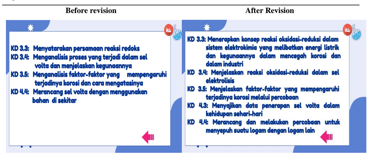
Figure 1. Basic Competencies in the Electrochemistry Virtual Laboratory before and after revision

Material aspects in learning media, the validity value that gets the medium category is in the clarity of learning objectives and the relevance of learning objectives with KI/KD/Curriculum 2013, so that the validator provides suggestions to follow KD that are adjusted to the learning objectives in the Basic Competencies of SMA/MA Ministry of Education and Culture 2013. Furthermore, in animations that are unable to explain the concept of the material, so the validator provides suggestions to add animations and materials related to redox material because before the revision the concept of redox was still lacking for students to learn. After improvements were made as attached to the revision results.