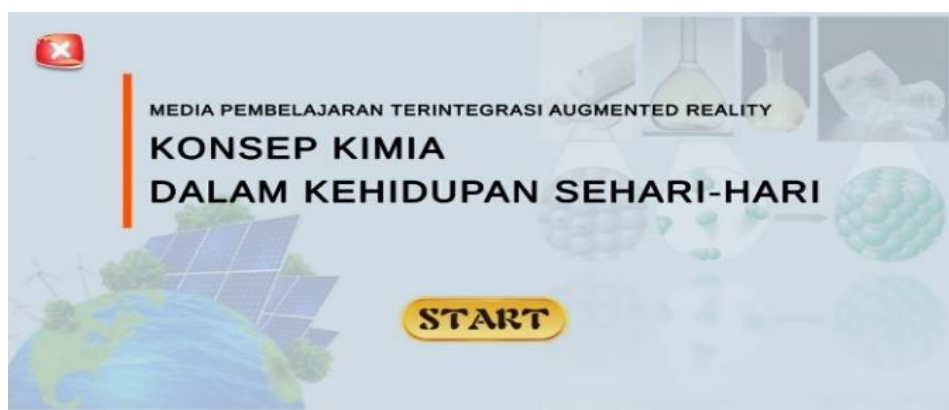
Figure 1. Cover page