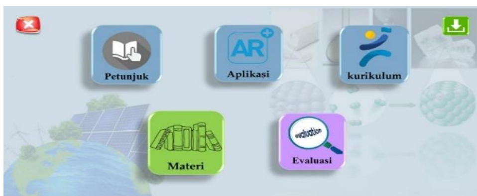
Figure 2. Main menu page.

On the main menu, there are several active buttons, including, exit buttons, download buttons, instruction buttons, buttons about the application, curriculum buttons, material buttons, and evaluation buttons. Exit button to exit the app. The download button contains the manual book. The material is delivered in several ways, such as with guiding questions, with Augmented reality, pictures, videos, and with quizzes. Augmented reality displayed in the media learning is in the form of three-dimensional animation delivered in three levels of chemical representation (Figure 3). Interconnection between the macroscopic level, submicroscopic, and symbolic is important for students so that they can understand the concept of chemistry in its entirety (Permatasari et al., 2022). This will also reduce the potential for misconceptions in students in understanding abstract chemical concepts (Suparwati, 2022).