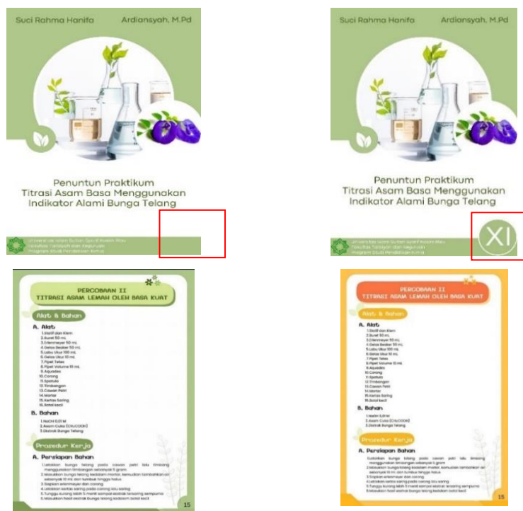
(a) Before revision

that the guided inquiry-based acid-base titration practical guide is very suitable to be used to support practicum learning in the laboratory with a feasibility level of 93,33%.